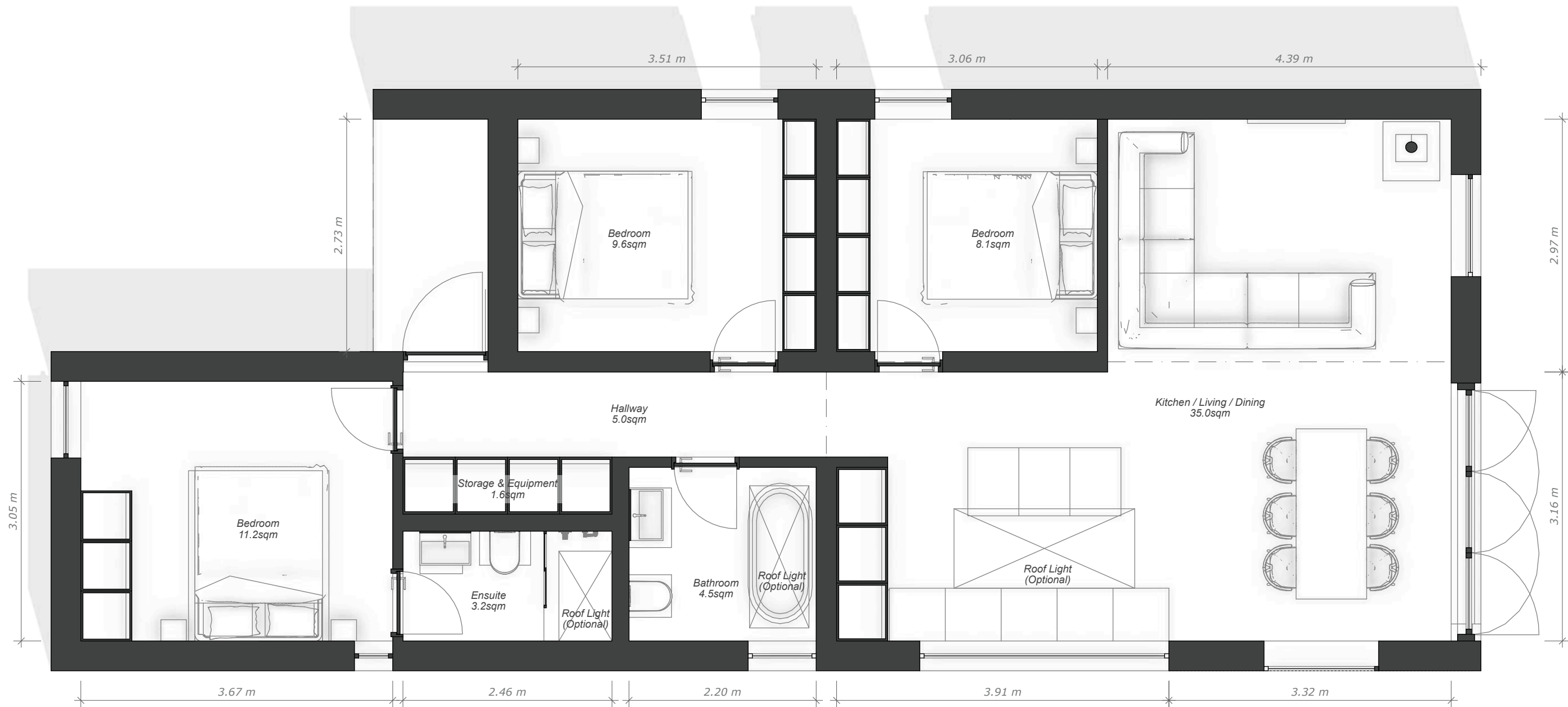
1 3 Bed Floor Plan Scale: 1 : 50