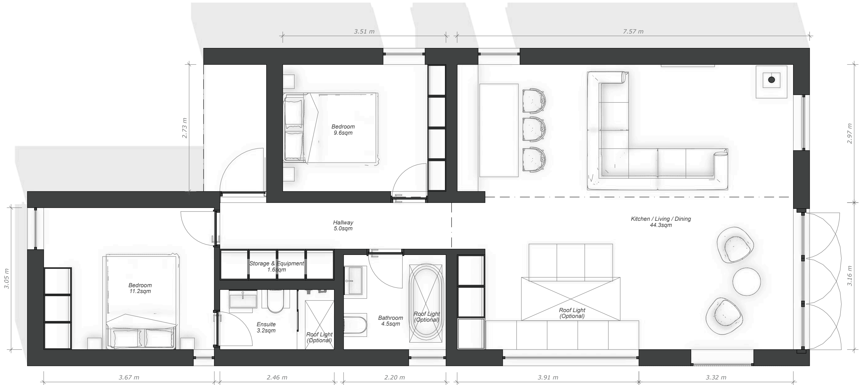
1 2 Bed Floor Plan Scale: 1 : 50